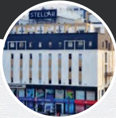
Stellar IT Park Sec-62, Noida