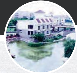
Stellar Gymkhana Club KP-II, Greater Noida