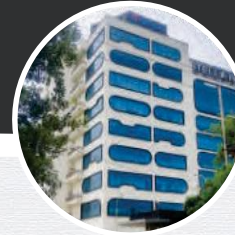
Stellar 135 Sec-135, Noida