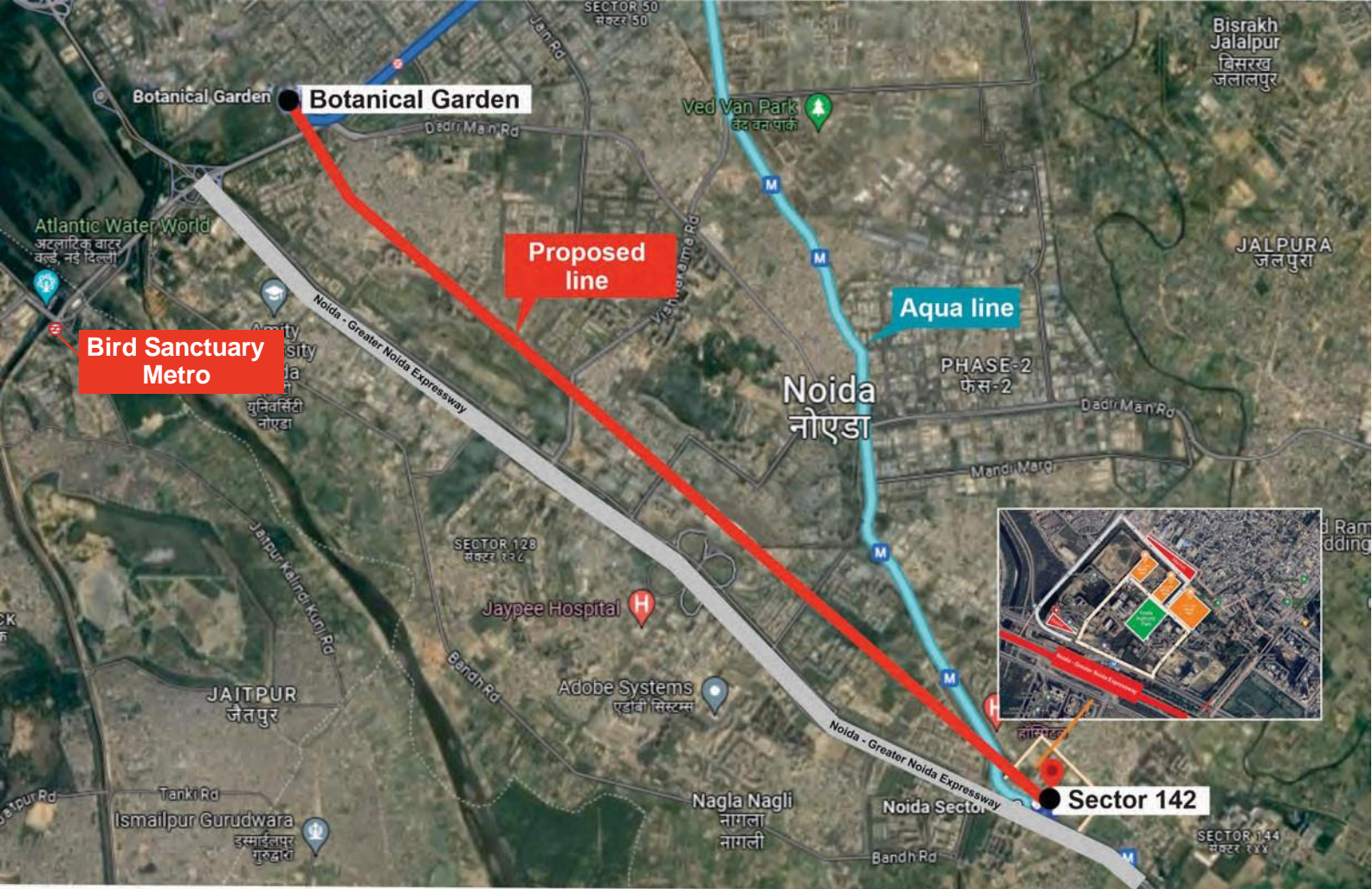
Connectivity between Delhi and Greater Noida (Proposed Direct Metro Link)